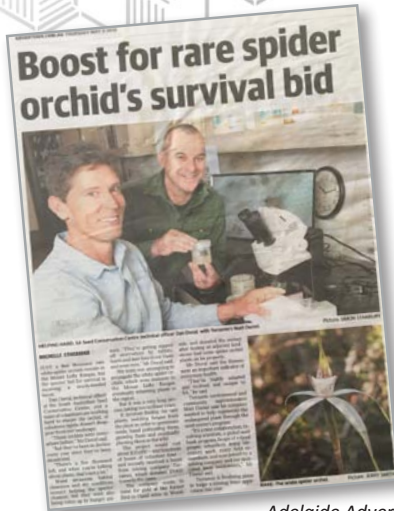
Adelaide Advertiser - 9 May 2019